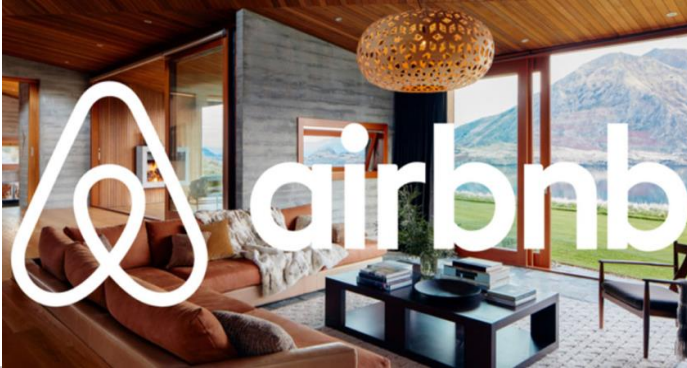
Residential & Rentals