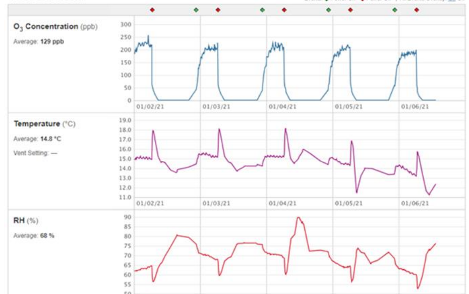
Trend Chart Data

We are the only solution that offers customized O3 treatment with adjustable controls to ensure 100% effective treatment regardless of temp and humidity environment and size of the treatment area.