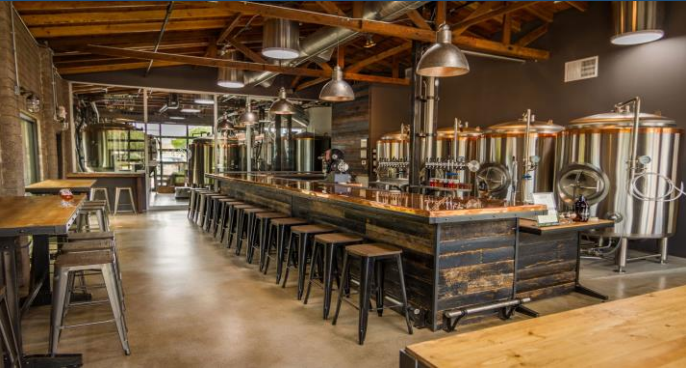
Restaurants Breweries & Bars