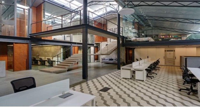
Offices & Warehouses